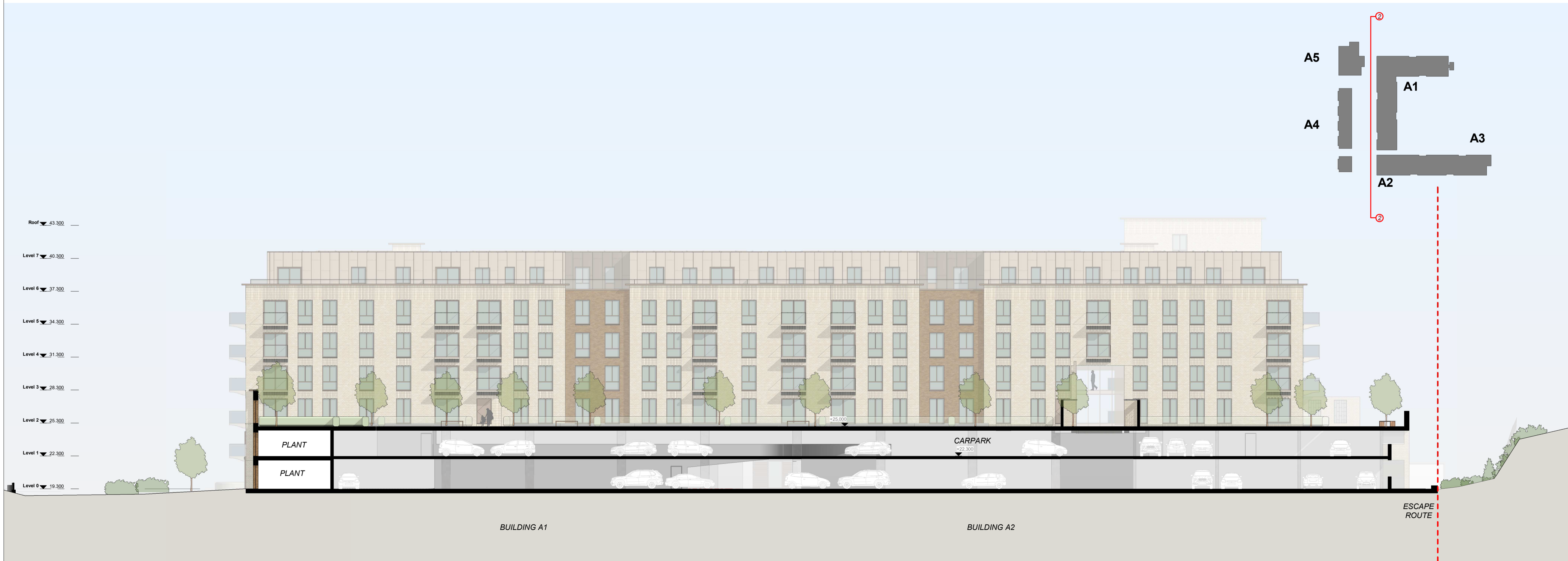
2 West Elevation 1:200