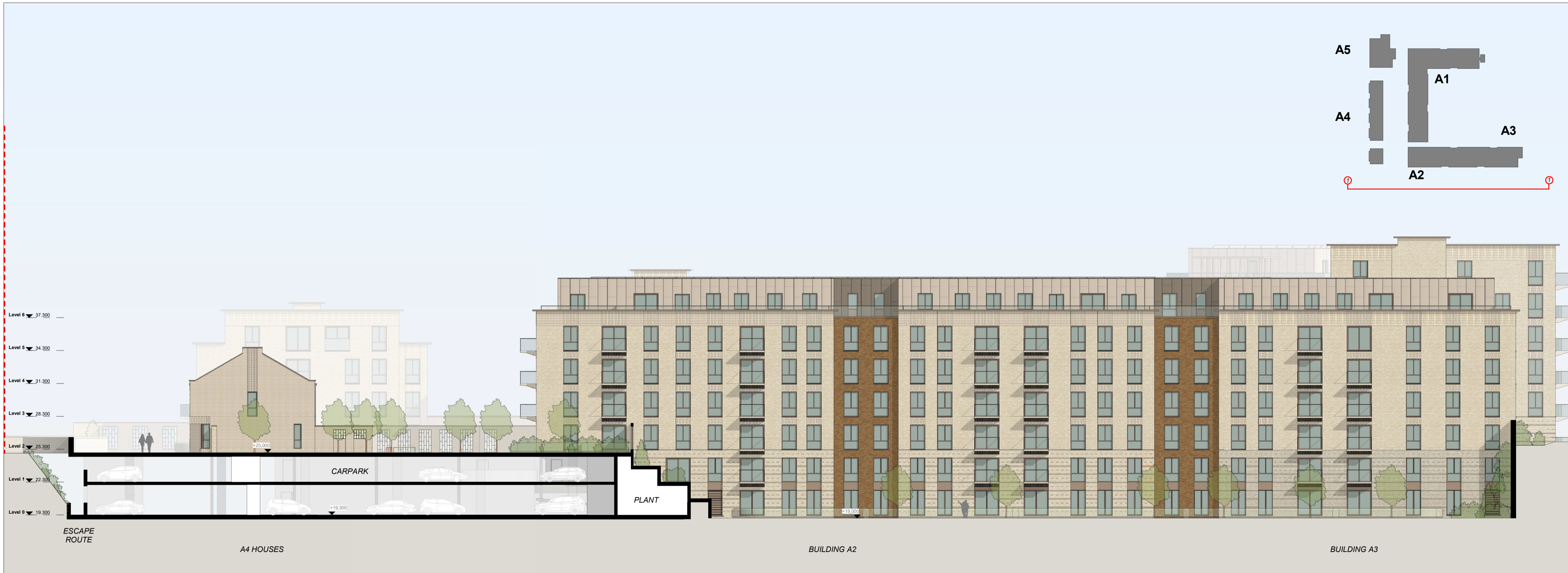
1 South Elevation 1:200